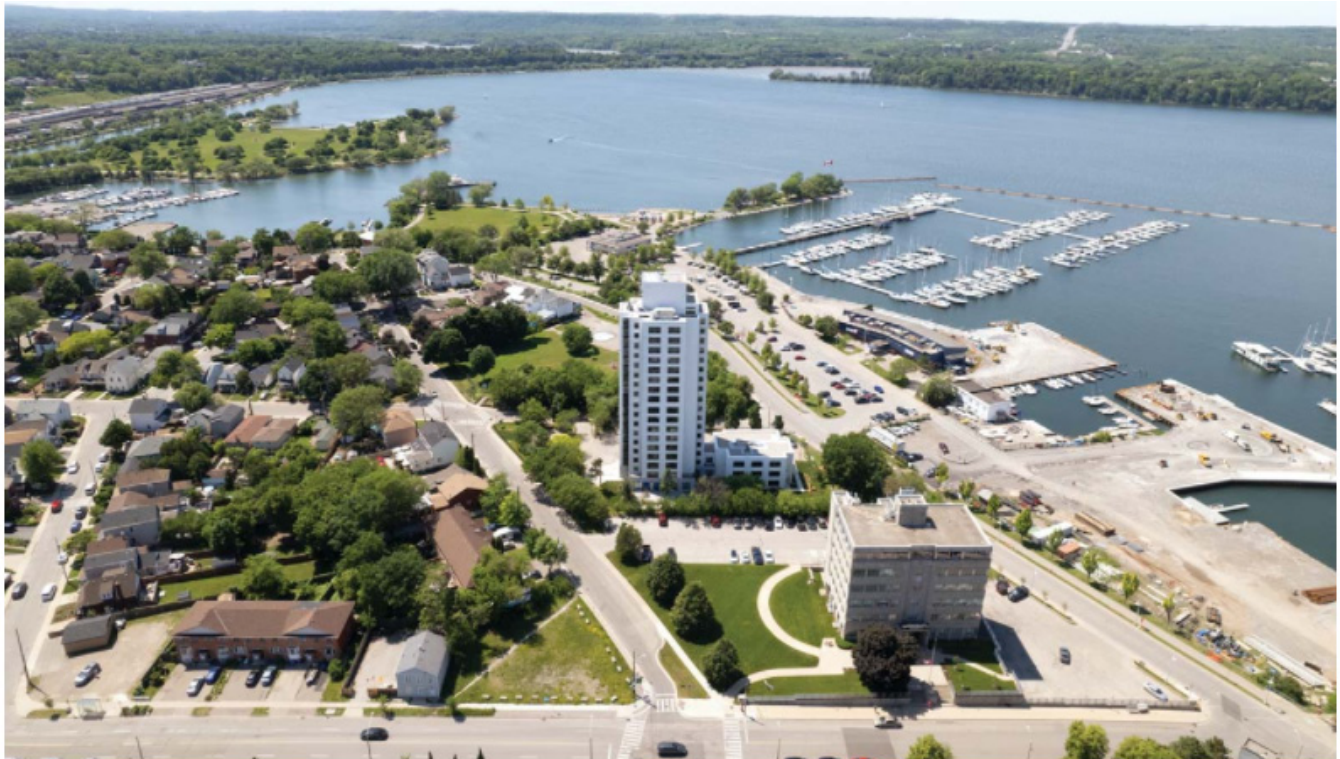
The Ken Soble Tower and Hamilton harbour.

In celebration of design excellence in Hamilton over the past two years, the 2021 Urban Design and Architecture Awards held a virtual ceremony on November 4, 2021.