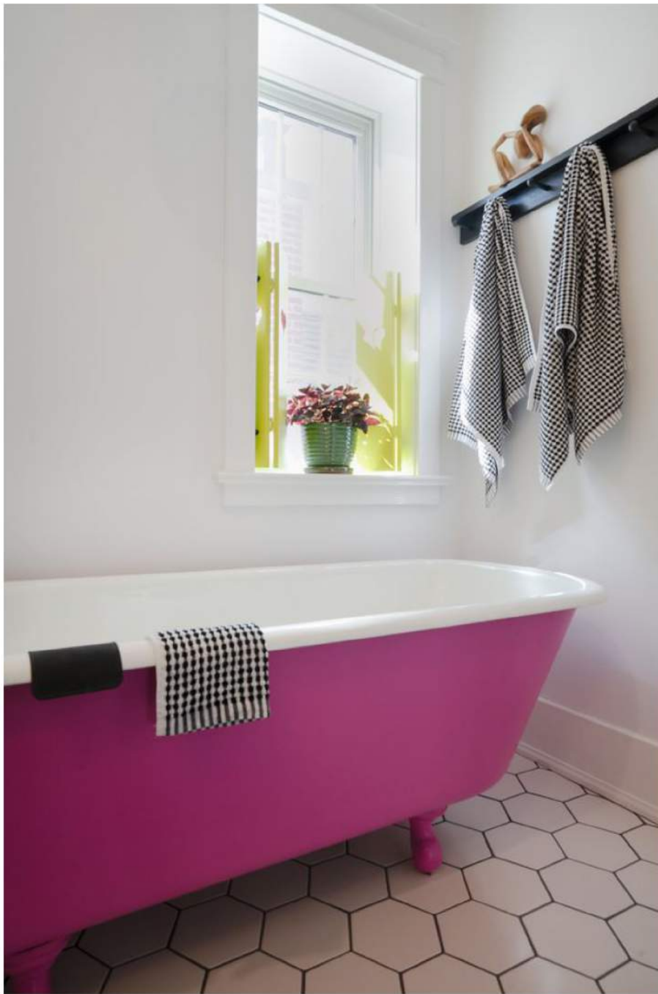
The bathroom features a restored, hot pink, claw foot tub.