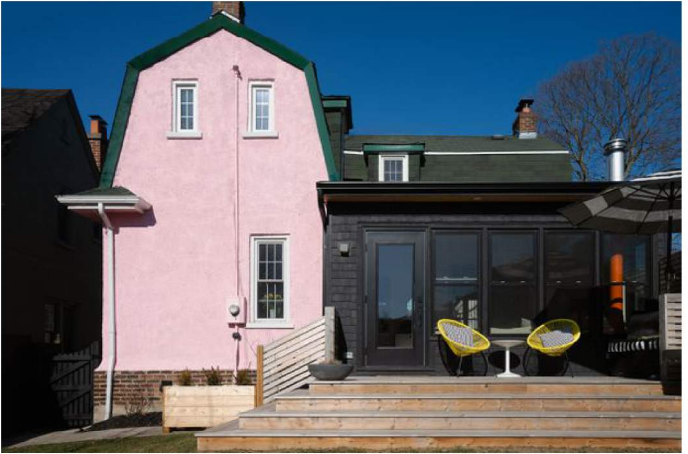
CAMERON SNYDER/CAMERON SNYDER

© Copyright 2021 The Globe and Mail Inc. All rights reserved.